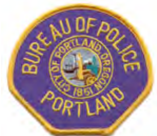
Thomas Jeffries R27 Portland, OR PD EOW 07/21/1997