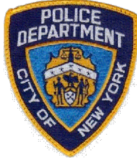
Claude Richards R2 NYPD EOW 09/11/2001