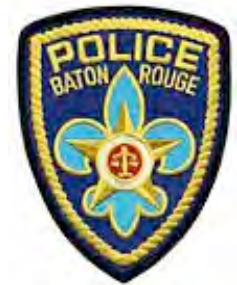
Vicki Wax R8 Baton Rouge, LA PD EOW 05/22/2004