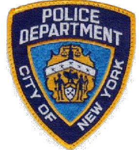
Jerome Dominguez R2 NYPD EOW 09/11/2001